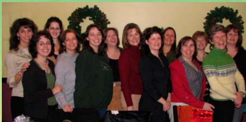
Champion Teammate Supervisors in New England