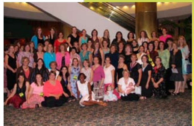
Champion Teammates at National 2006